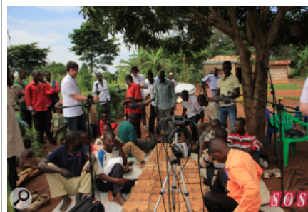
Global Sound Movement personnel recording samples in Uganda.