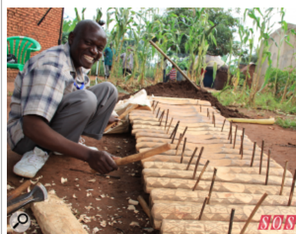
A local Ugandan musician playing one of the instruments, the Amadinda, sampled by the Global Sound Movement.