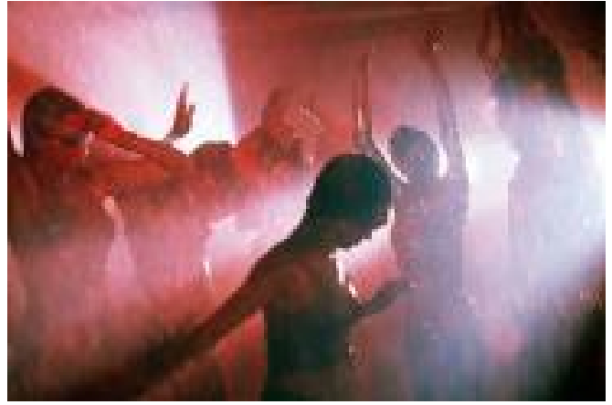
10 blood-curdling techno tracks for Halloween