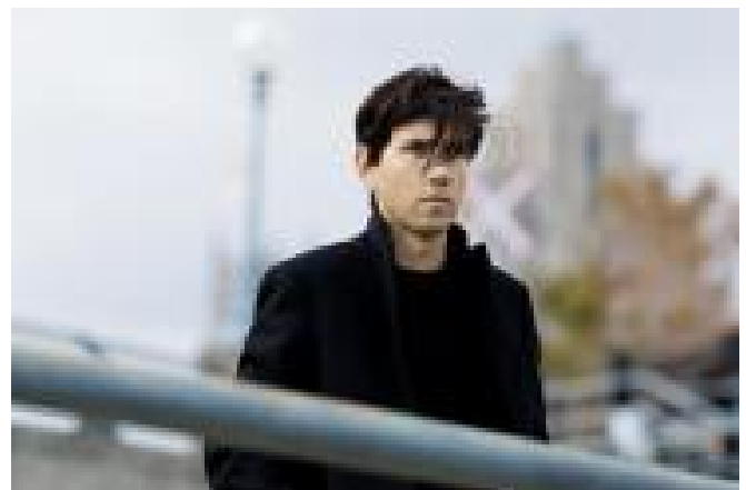
Tiga signs to Counter Records for new album